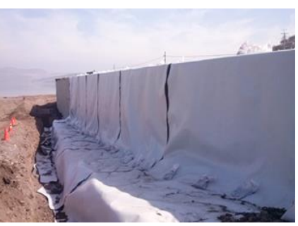
Left: Tierra Armada engineers designed the Reinforced Earth® wall to be raised to almost 22m high in Stage 2.

Above: Geomembrane water-proofing system covering the upstream wall face.