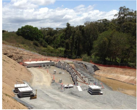
Left: Front view panel finish Above: Site picture

This combination of engineered fill, soil reinforcement and facing panel creates a robust platform that can withstand very high dead and live loads together with the vibrations generated by rail traffic. Thus it is well suited to the needs of the Gold Coast Rapid Transit project.