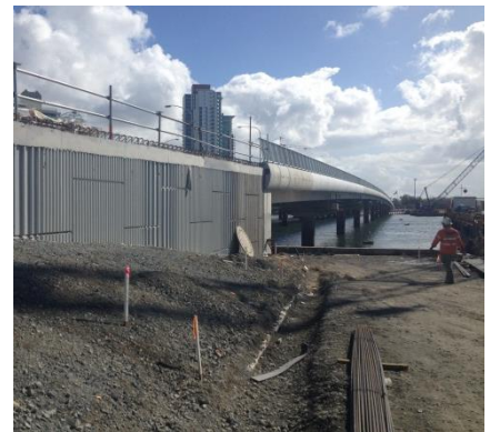
Main: Side-view of the complete structure of Gold Coast Rapid Transit Above top: The finish was custom designed as the vertical rib varies in width through the wall. Above bottom: The construction site is in the immediate vicinity of the ocean