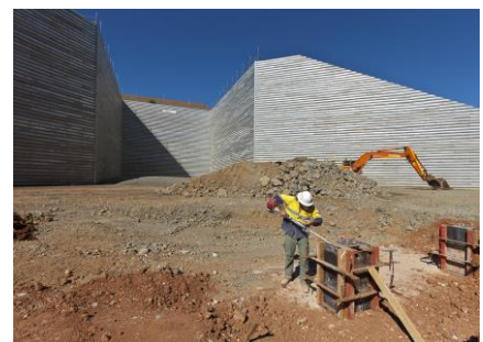
Main picture: Reinforced Earth's® two TerraMet® walls for crushers 3 and 4 – Sino Iron Ore project. This picture also includes a full view of the Sino Iron Ore site still under construction.