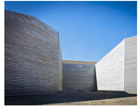
Left and above: One of RECO's completed TerraMet® dump walls.

The difficulty this method posed was the non homogeneous and unreliable nature of the geotechnical conditions below ground which could only be identified as the excavation proceeded. This resulted in continuous redesign to accommodate the changing ground conditions in conjunction with increased costs and delays.