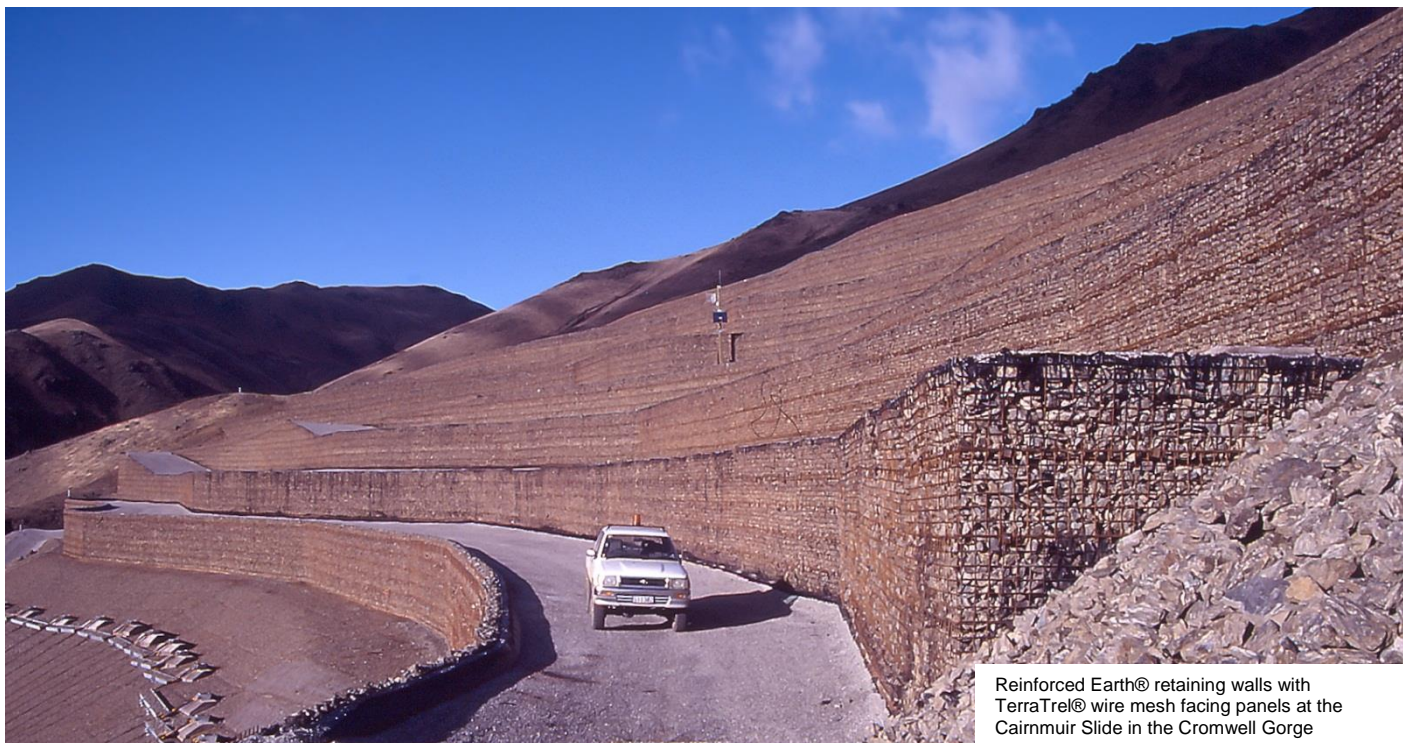
Reinforced Earth® retaining walls with TerraTrel® wire mesh facing panels at the Cairnmuir Slide in the Cromwell Gorge