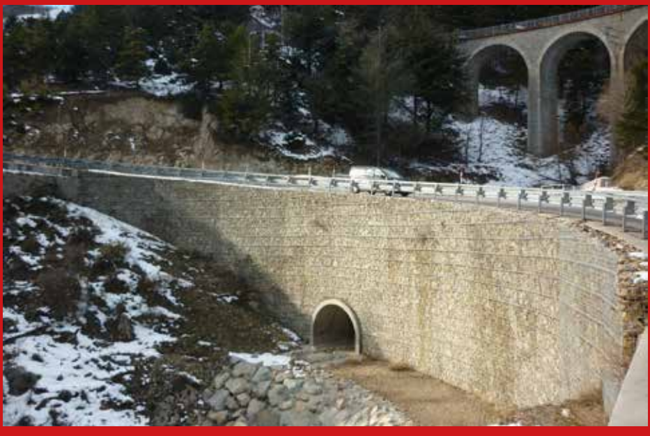
RN 116, Créneaux du Pallat, France