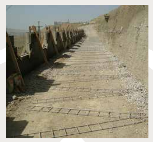
Friction Link system with steel strips

The TerraLink<sup>™</sup> technique allows the construction of Reinforced Earth® walls in front of existing structures, with narrow space between them. Since the reinforced fill zone is not wide enough to accommodate conventional lengths of reinforcements, the acceptable solution consists in connecting the Reinforced Earth mass to the existing structure. The whole configuration forms a shored retaining wall that ensures a sound structural behavior.