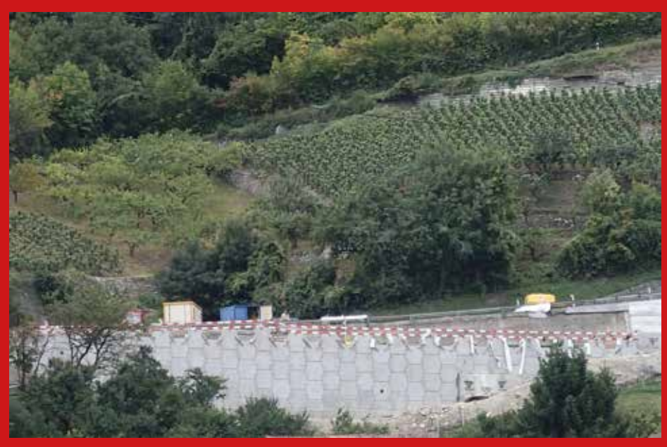
RC 62 near Sion, Switzerland