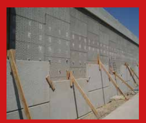
I-215 On-Ramp to Southbound I-15 Ramp widening, Salt Lake County, Utah, USA