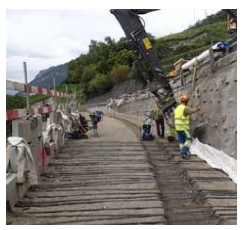
Friction Link system with synthetic strips

TerraLink™ elements are similar to those used for Reinforced Earth® solution: soil reinforcements (steel or geosynthetic), connected to modular facing systems (precast concrete panels, welded wire mesh and connection parts). These elements are placed between well compacted backfill layers. The main feature is that reinforcements are linked to the rear part (backface) of the system through the existing structure, which enables combination or continuity of the reinforcements between the narrow Reinforced Earth® wall and the existing structure.