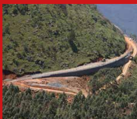
Langeni, South Africa