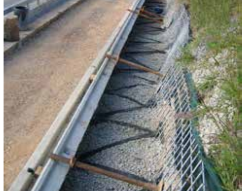
Direct Link system with synthetic strips

The reinforcements of the Reinforced Earth® wall are directly connected to the existing structure. This solution easily adapts to very narrow or limited space but requires further precautions in terms of construction.