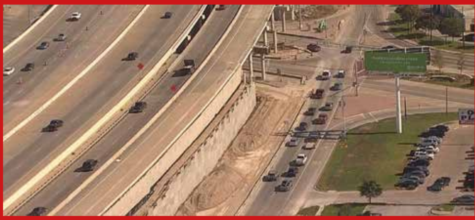
North Tarrant Express near Dallas, Texas, USA