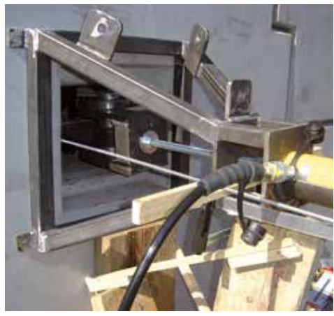
In situ extraction tests