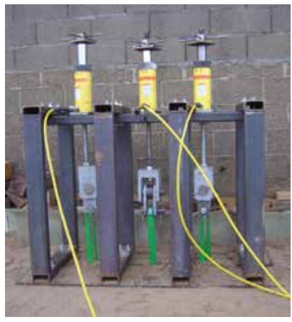
Strength testing the panels under the effect of the tensile load of reinforcements