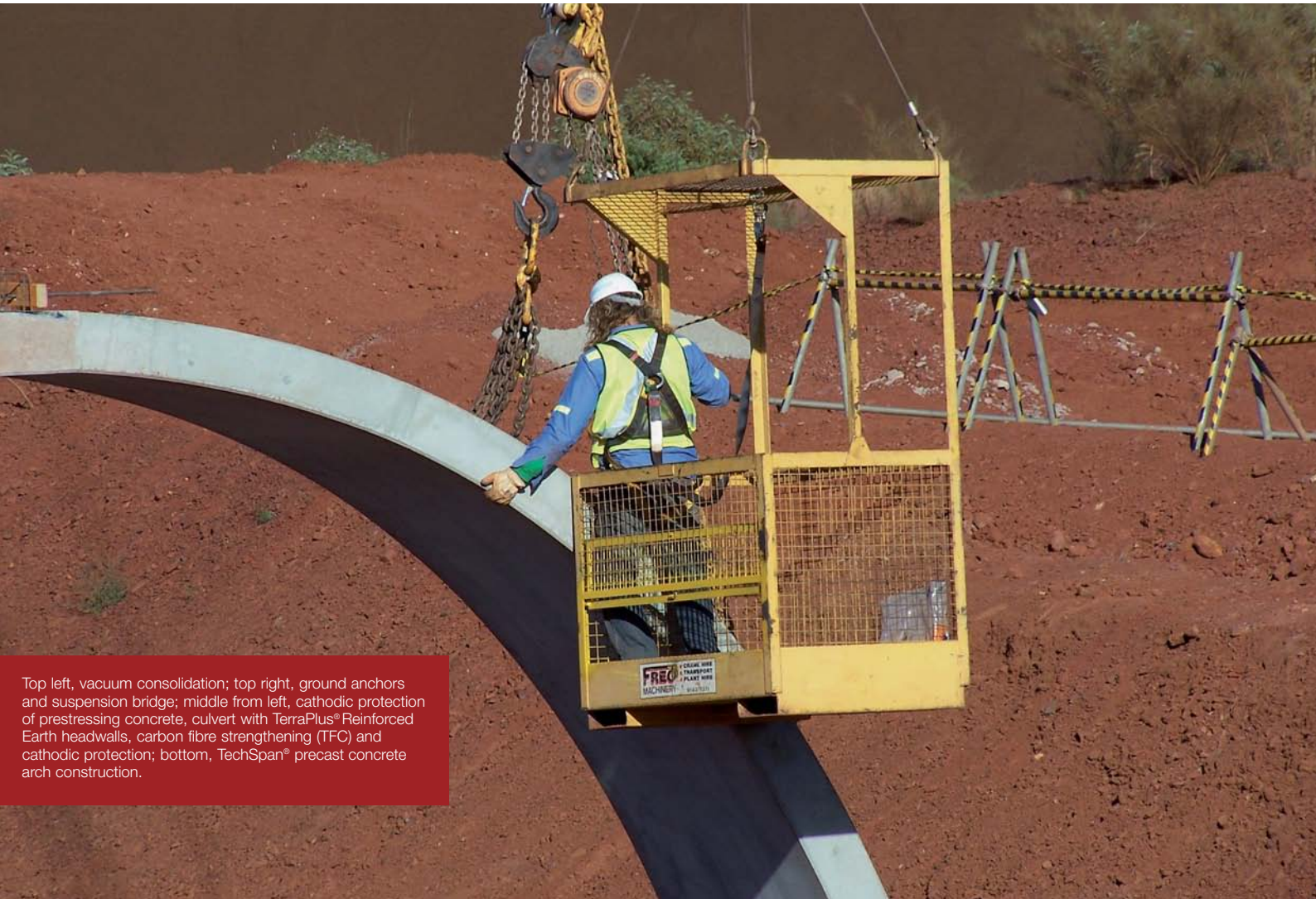
Top left, vacuum consolidation; top right, ground anchors and suspension bridge; middle from left, cathodic protection of prestressing concrete, culvert with TerraPlus® Reinforced Earth headwalls, carbon fibre strengthening (TFC) and cathodic protection; bottom, TechSpan® precast concrete arch construction.