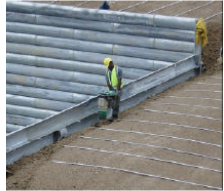
Main picture: RECO site supervisor, Geoff Slavin with Starwest construction team.