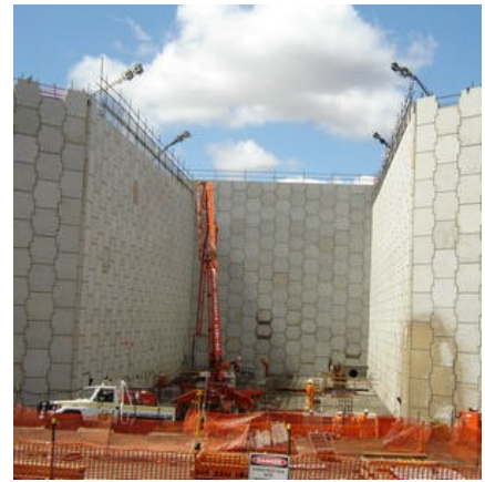
Left: Aerial Photograph Above: Installation of final course of TerraClass® panels

RECO employed the services of Michael Adler & Associates geotechnical consultants to inspect, assess, design and certify the foundation.