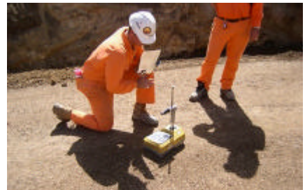
Main Picture: Blackwater CHPP TerraClass® Dump Structure construction nears completion Top and Center: REhas® soil reinforcing strips Above: Compaction testing