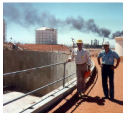
Four Reinforced Earth containment dykes, constructed using the TerraClass® system protect propane / butane storage tanks at Stony Point, South Australia.

Industrial, energy, military and hydraulic infrastructure